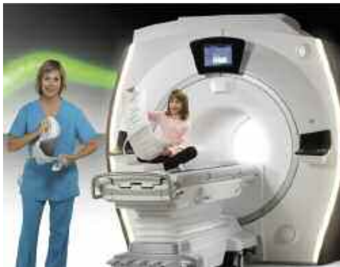
Magnetic Resonance - RM - Optima 450 W 1,5 Tesla