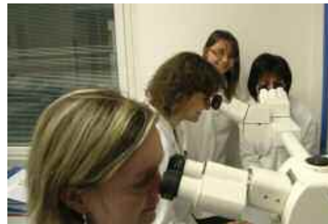
Researchers working at the Neuro-bio-oncology Research Centre

In addition to its principal operative units such as Orthopaedics, General Surgery, Urology and Gynaecology, Santa Rita Clinic offers an important Neuro-bio-oncology (brain neoplasms) Research Centre.