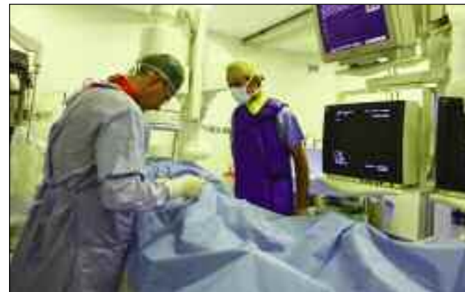
Cardiological Angiographic System: