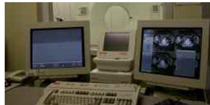
Computerized Axial Tomography