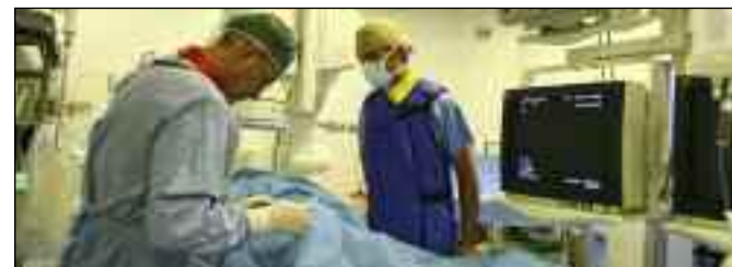
Cardiological Angiografic System