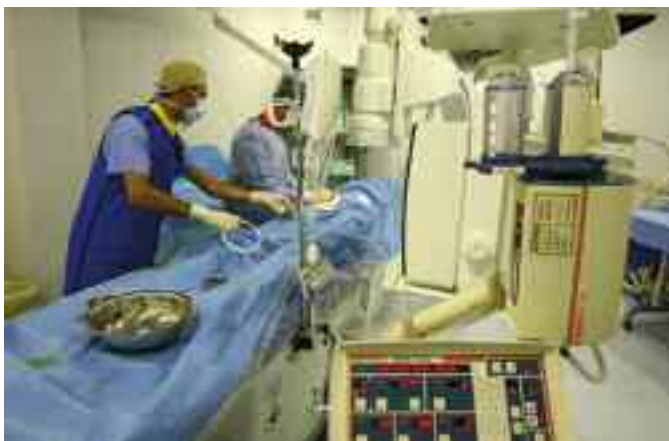
Cardiological Angiographic System